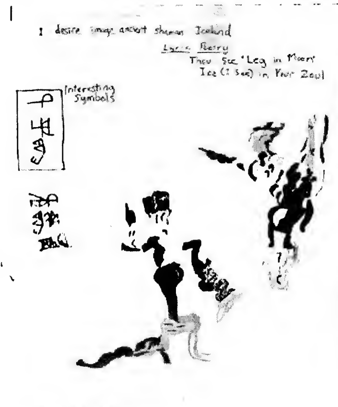
Leg in Moon the Ice Shaman

reader with a kind of awe, turn the picture upside down and examine it again. Suddenly, what appeared to be a Flame Angel now emerges as a Sorcerer flinging a fireball toward the observer, surrounded at each of the cardinal points by large flames. Above his head, the sorcerer appears to have opened a rift exposing a star populated portion of deep space!