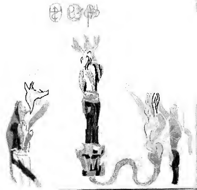
Sabbath of the Succubus

Below are two examples of spirits evoked utilizing automatic drawing technique. The second drawing will be discussed at length momentarily, but for the moment take note of how each of the drawings consist of outlined figures, not detailed images. Greater detail can be added after an artist has developed some skill with the automatic painting process.