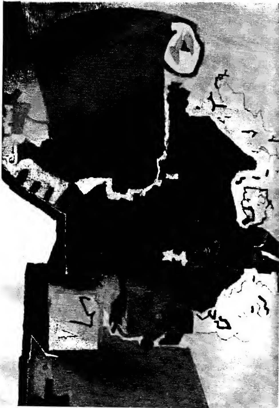
The Salvation of a Controlbot