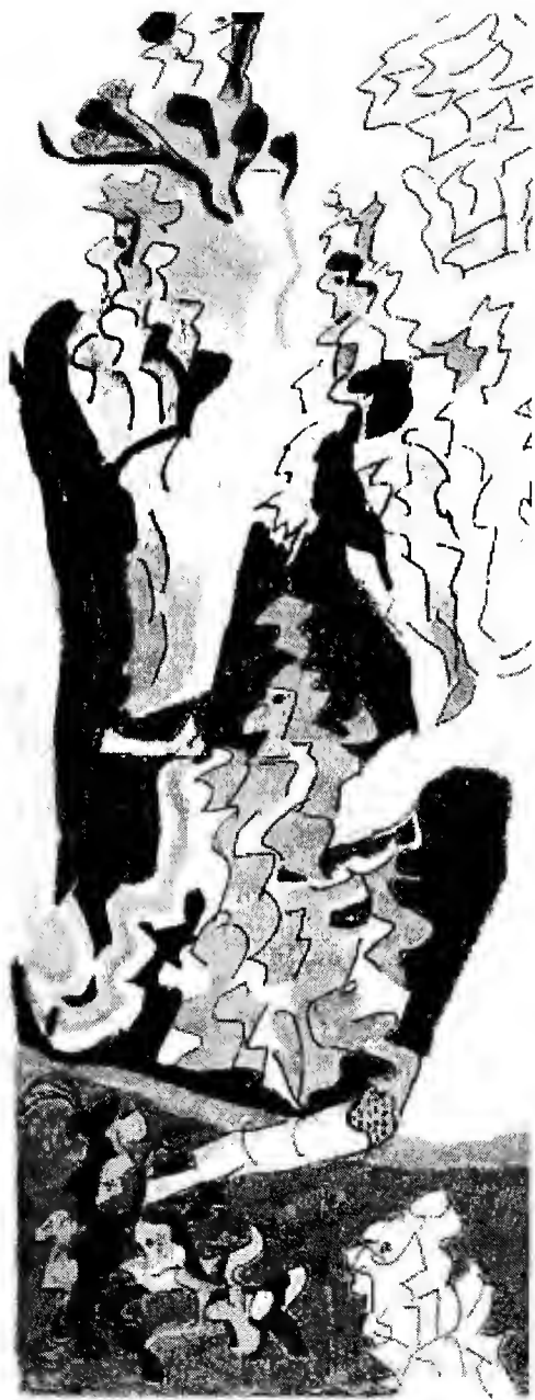
Peering Into the Past